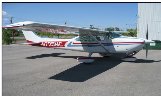
N735MC 1977 Cessna 182Q Skylane

The Piper Warrior is a four seat, well maintained IFR equipped fixed gear aircraft. Avionics include a Garmin 300XL IFR GPS, a King KX155 NAV/COM radio with glide slope and DME. It is a great platform for primary and advanced training or just to build time.