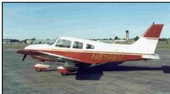
N8198V 1982 PIPER WARRIOR II

The Piper Warrior is a four seat, well maintained IFR equipped fixed gear aircraft. Avionics include a Garmin 300XL IFR GPS, a King KX155 NAV/COM radio with glide slope and DME. It is a great platform for primary and advanced training or just to build time.